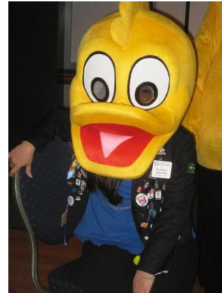
Brazilian Exchange Duck